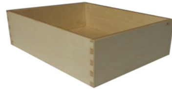
(Shown in B/BB Birch)