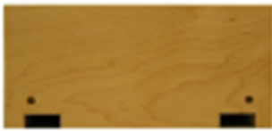
Standard Notch: 1/2" x 1 3/8" 1/4" x 3/8" guide hole.