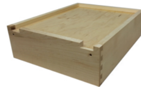
Standard Inset: 1/2" (Drawer shown upside down)