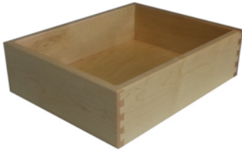
(Shown in Maple)